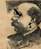
SENATOR DANIEL H. HILL.

Continued Schedule in Other Page by (Cont.)